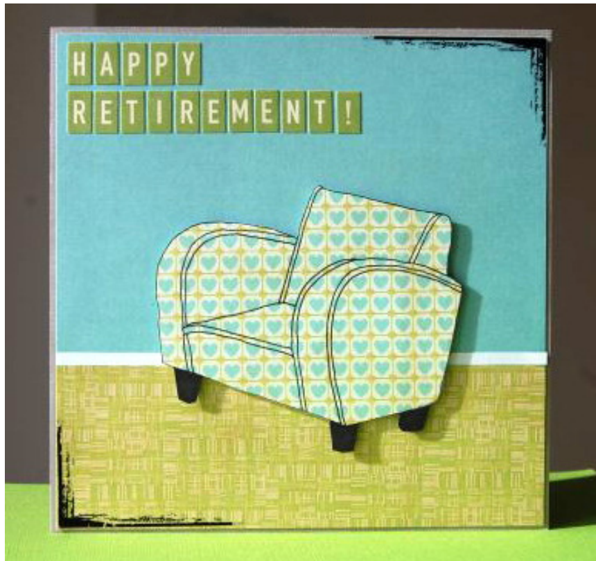
Card above made using the Comfy Retro Chair template from page 9 of your August templates set.