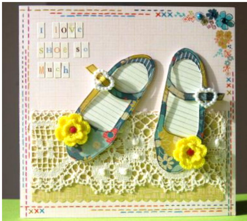
Card bellow made with the Mary Jane Shoes template on page 5 of your August templates set.