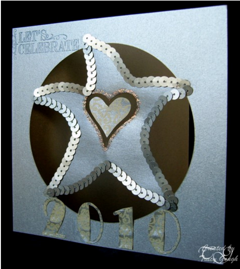
Card above made with one of the 'Stylised Flowers' templates on page 9 of your templates set.