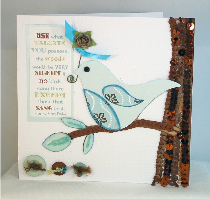
Card by Kathy Black