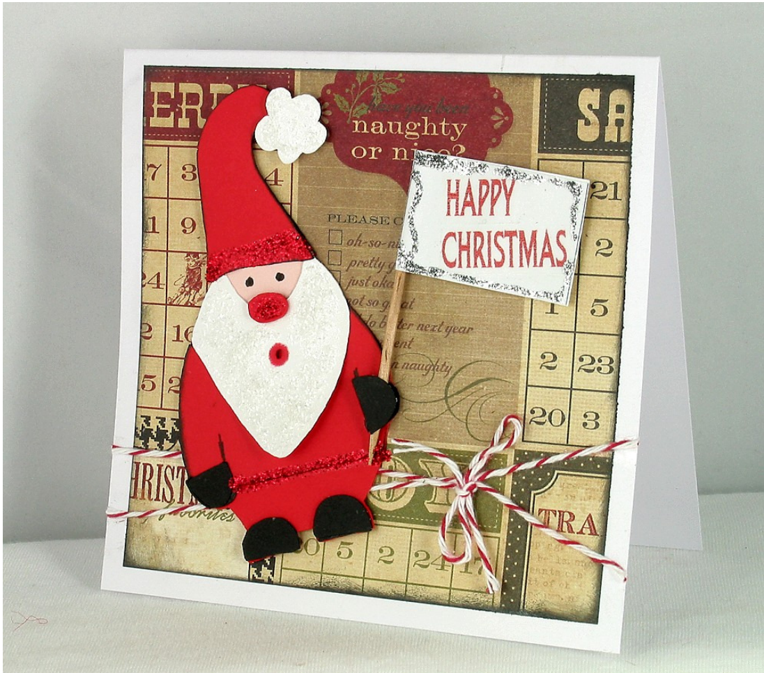
Card made using the 'Santa Gnome' template on page 1 of your November 2011 Crafty Templates set.