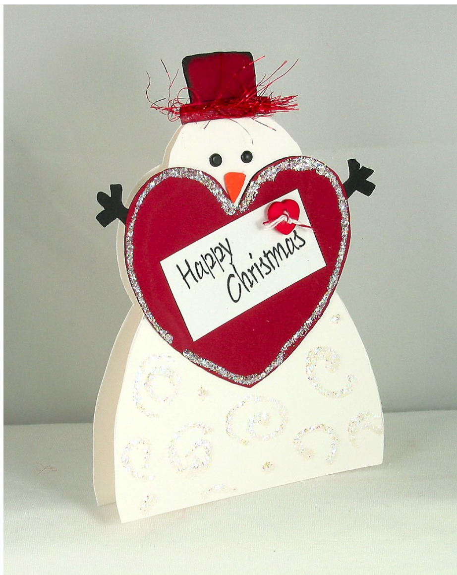
Card made using the 'Snowman Heart' template on page 5 of your November 2011 Crafty Templates set.