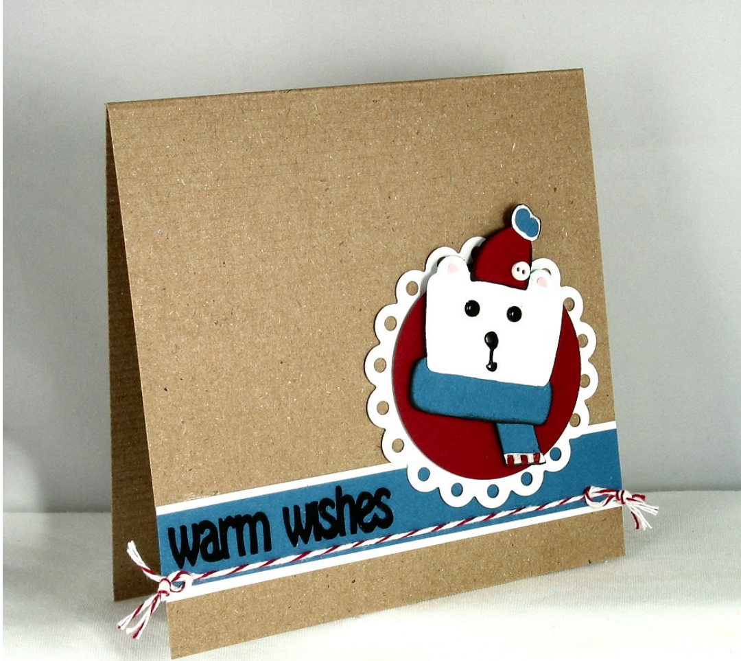
Card made using the 'Winter Pals Bear' template on page 15 of your November 2011 Crafty Templates set.